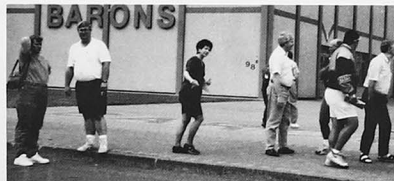
"Oh, man. We thought we heard the ice cream truck," says a group of teachers in front of the school.